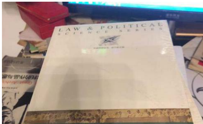
Figure 2 Experimental assumptions

Although information sharing can help consumers to make purchase decisions to a great extent, excessive information can also lead to confusion in consumers' cognition and difficulty in making decisions. online reviews differ in many dimensions. consumers need to screen information when making purchase decisions. only high-quality and efficient online reviews can bring accurate guidance and influence to consumer decisions. Online reviews affect consumers' purchase decisions by influencing consumers' perception of the credibility of comments. Therefore, comment credibility plays an intermediary role in consumer purchase decisions and online reviews. For the above reasons, the hypothesis in Figure 2 is first proposed: